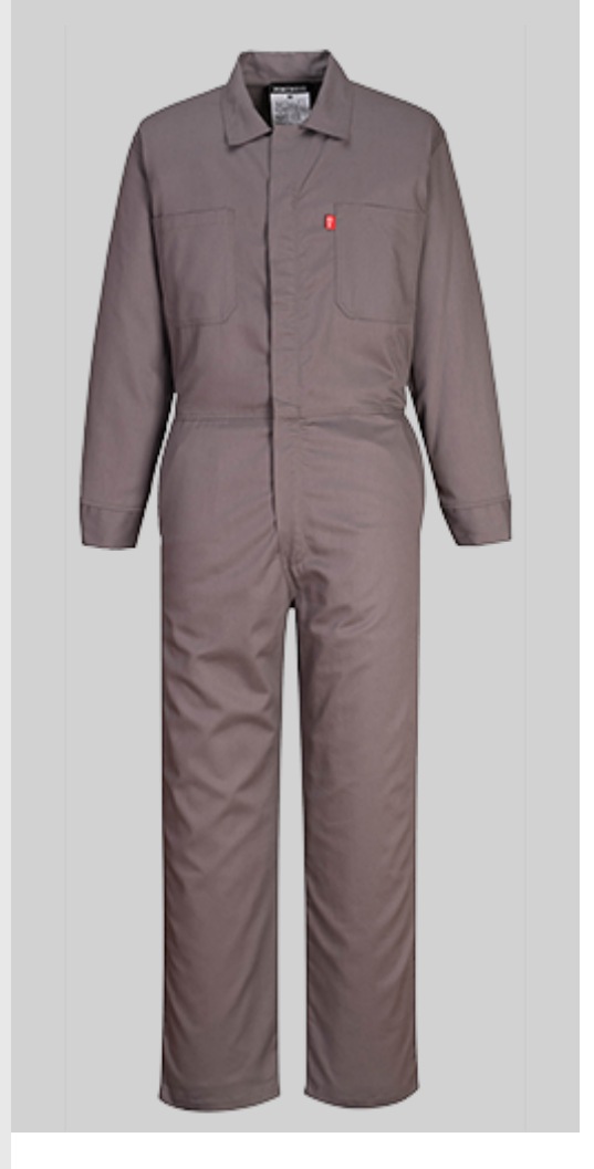
Navy, S-6XL Gray, Khaki, S-3XL